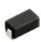
SMX 2.5 x 5 x 2