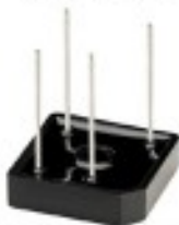
MP15W-MP25W-MP35W 29 x 29 x 7.9