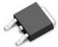
D-PAK 6.5 x 10 x 2.3