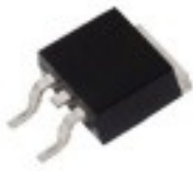
D2pak 10 x 15 x 4.5