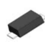
SMAF 2.6 x 5 x 1