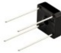
BR-3 15.2 x 15.2 x 5.2