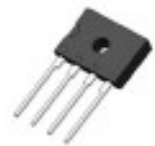
D3K 14 x 24 x 3.1