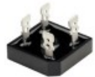
MP15-MP25-MP35 29 x 29 x 19.5