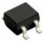
MD-5 6.8 x 4.7 x 2.5