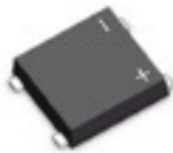
LMDS 5.8 x 4.7 x 1.2