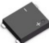
MSB5 8.1 x 6.6 x 1.4