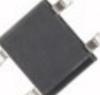
SLDB5 6.2 x 5 x 1.5