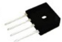
RBU 22 x 36 x 3.5