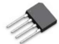
RS-1M 14.5 x 25 x 3.5