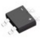
MB-F 6.8 x 4.8 x 1.5