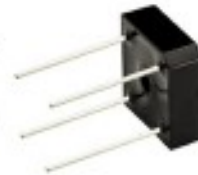
BR-8 19 x 19 x 7